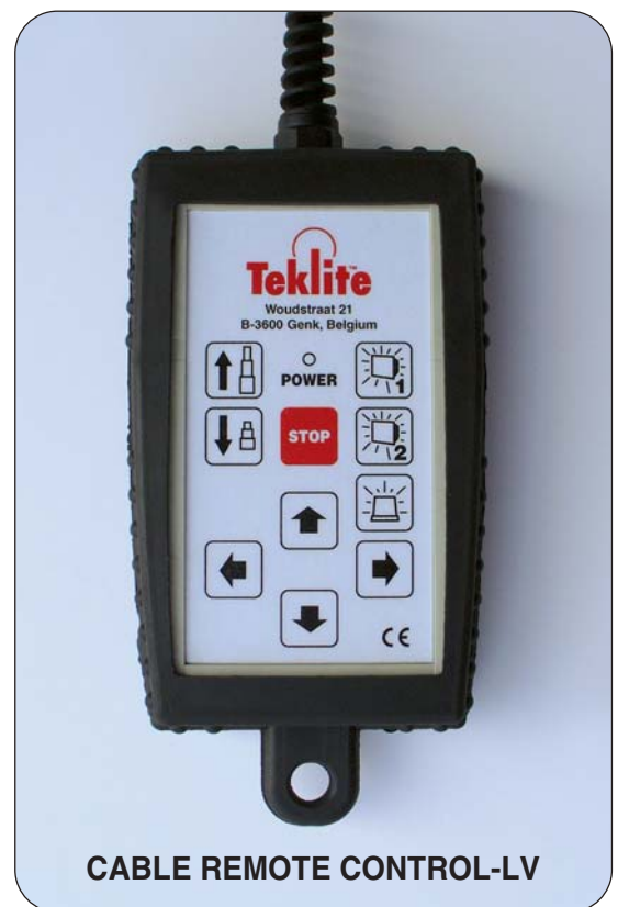
CABLE REMOTE CONTROL-LV