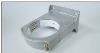
Upper Mounting Bracket