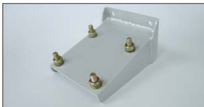
Lower Mounting Bracket