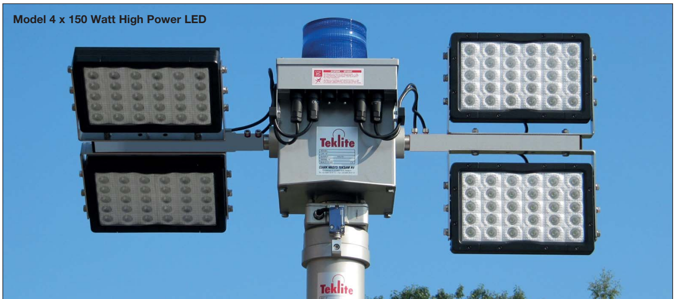
Model 4 x 150 Watt High Power LED